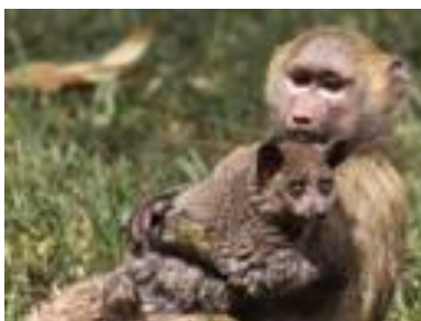
Yellow baboon- female with baby

The Yellow baboon has yellow-brown to yellow-grey fur. Their cheek hair is lighter than the hair on top of their heads. Adult males have a mane (like a lion) and babies are born with black fur. They eat grass, seeds, young leaves, fruits, roots, cereals, young birds and small mammals. They will eat whatever foods are around. Yellow baboons live in more than one male, more than one female groups with alpha (dominant) individuals. They have overlapping territories. Juvenile females inherit their mother's rank in the group. Group-size depends on how much food is available and by how many animals that eat them are (predators) in the area. They spend most of their time on the