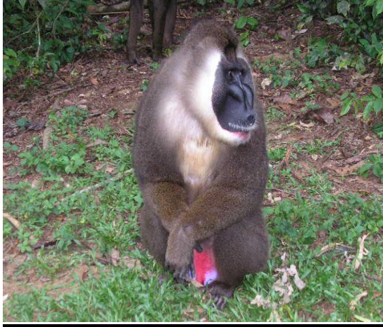
Drill monkey- male

Drills- They are found only in Cross River State in Nigeria , southwestern Cameroon (south to the Sanaga River ), and on Bioko Island , part of Equatorial Guinea meaning rainforests . The Drill is a short-tailed monkey that looks a lot like the mandrill, but doesn't have the bright blue and red on the face of that species. The body is overall a dark grey-brown. Mature males have a pink lower lip and white chin on a dark grey to black face with raised grooves on the nose. The rump is pink, mauve and blue. Female drills lack the pink chin. A single dominant male leads a troop of around 20 females and is father to most of the young. This group of 20 may join others forming super groups of over 100. According to the season and the food available, they roam around. They will often rub their chests onto trees to mark their territory. They are semi-terrestrial that means they look for food mainly on the ground, but climb trees to sleep at night. The females have a single baby; female young remain in the troop, while young males move out to join other groups. They live up to 28 years and eat a wide range of fruit, but they also eat herbs, roots, eggs, insects, and sometimes small mammals. Drills are among Africa's most endangered mammals.