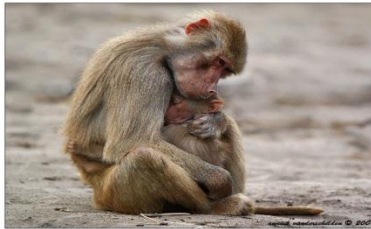
Hamadryas Baboon- female

Olive baboons live in groups or "troops" as they are often called, ranging in size from 15 to 150 baboons. The friendships between boys and girl baboons include relaxed grooming sessions, traveling and hunting for food together during the day, sleeping near each other, help defend them from bullies, and help each other in caring for babies. When two boys meet each other for the first time, the greeting begins when one male approaches another with a rapid wal , looking directly at the other male, smacking his lips, squinting, laying his ears flat against his head, and finally showing his bottom. One unusual thing seen in young olive baboons in Nigeria is their ability to swim and dive. They have been seen swimming with their faces under water in a river, and diving from trees that hang over the river. They "talk" to each other using noises.